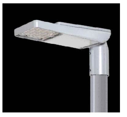
TYPE 2 & 3